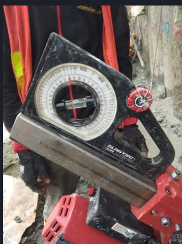
ANALYZING GROUND ANCHOR FOR SLOPE STABILIZATION