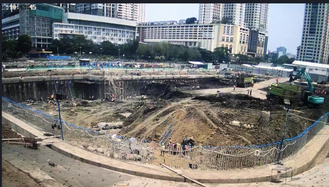
FOCUSING ON FOUNDATION WORKS OF SKY TOWER