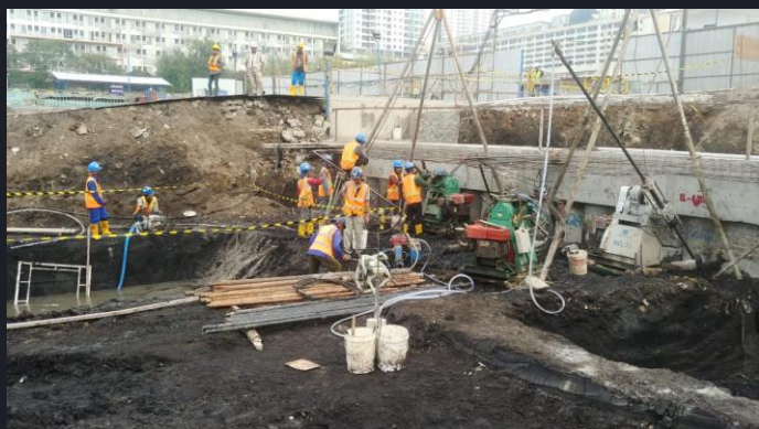
ALWAYS CHECK AND RECHECK THE GROUND ANCHOR