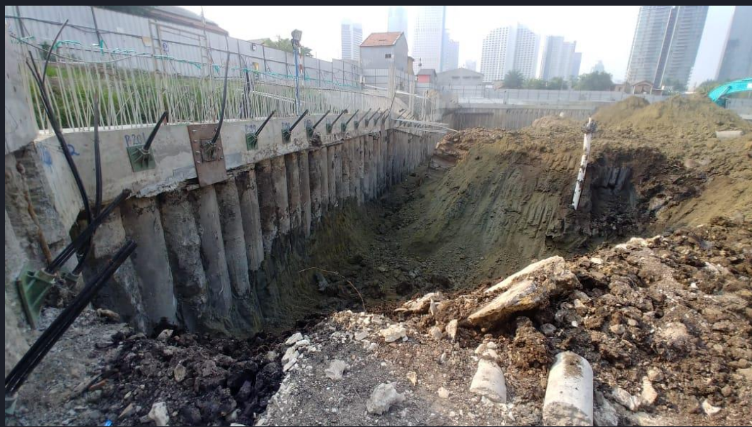
DEEP EXCAVATION OF THE EAST SIDE