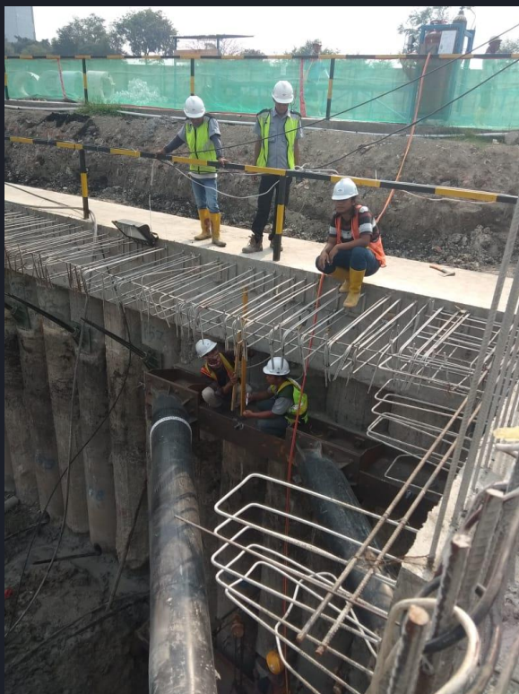
CHECKING THE STRUTTING QUALITY