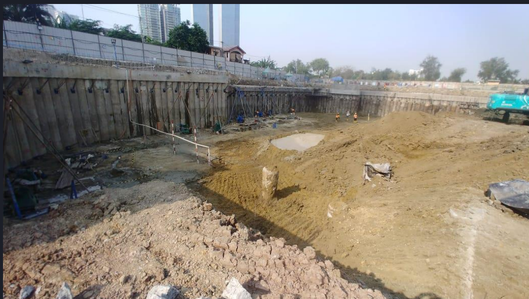
BASEMENT WORK FOR SKY TOWER HAS REACHED 9 METERS DEPTH