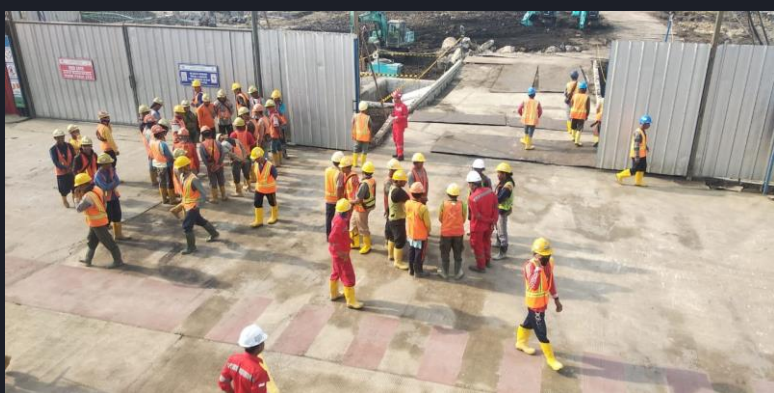
DAILY SAFETY BRIEFING IS A MUST, ENSURING WORKERS TO BE FULLY AWARE OF THE CONSTRUCTION RISKS