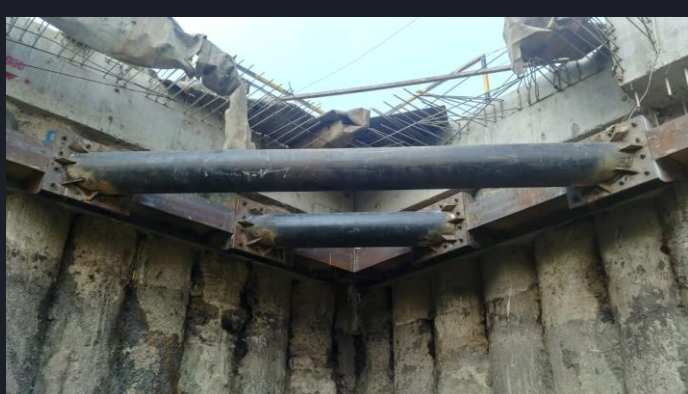
CORNER STRUT INSTALLED